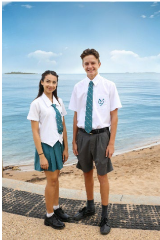
Senior Day Uniform