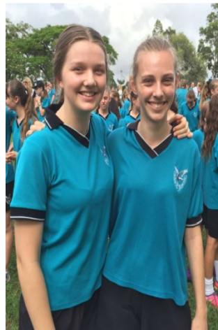
Unisex Sports Uniform