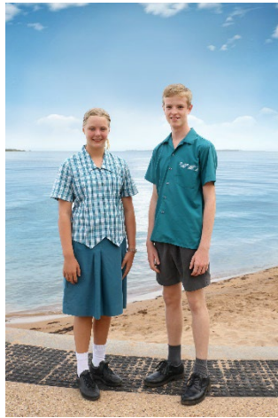
Junior Day Uniform